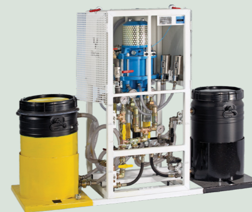
PHP piston pump for pumping distances up to approx. 800 metres

Two pneumatically driven pumps are available for the on-site application of Carbofill